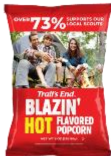
$20 Blazin' Hot Popcorn