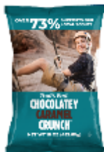
$30 Chocolatey Caramel Crunch