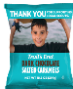
$30 Dark Chocolate Salted Caramels