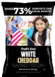
$20 White Cheddar Popcorn