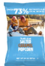
$25 Salted Caramel Popcorn