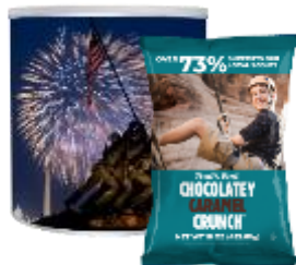
$35 Chocolatey Caramel Crunch Tin