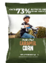
$10 Caramel Corn

Customers pay shipping: $7.99 plus $.99 per additional item (bundles of 2 are $8.98; bundles of 3 are $9.97). Products & pricing subject to availability and change.