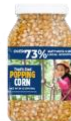
$15 Popping Corn Jar