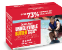
$25 Unbelievable Butter 12pk