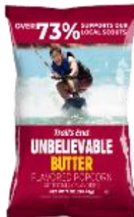
$15 Unbelievable Butter Popcorn