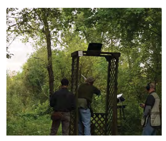
In 2016, $42,800 was raised to support Scouting in the counties we serve.