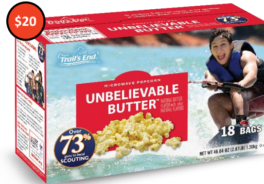
Unbelievable Butter – 18 Pack