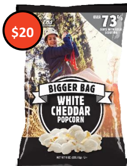
White Cheddar Cheese