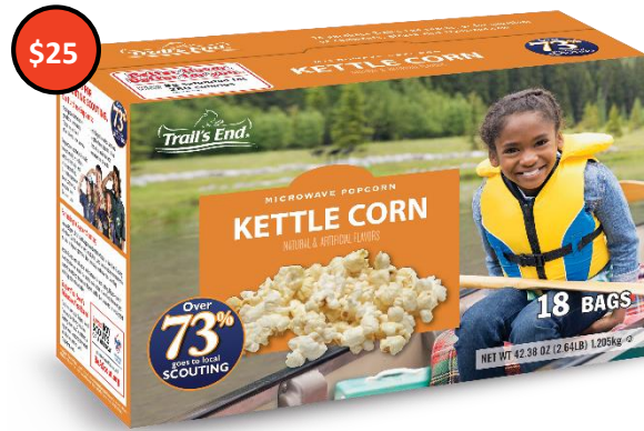
Kettle Corn – 18 Pack