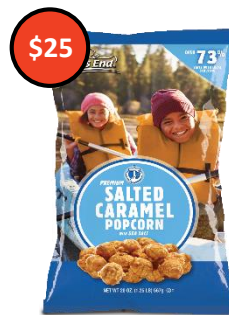
Salted Caramel Corn