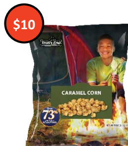
Classic Caramel Corn