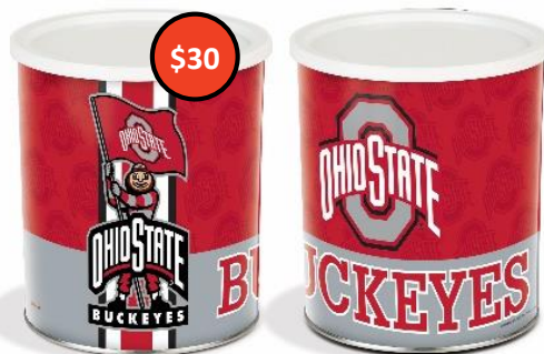
Premium Caramel Corn with Almonds, Cashews & Pecans