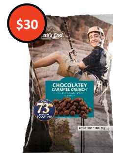
Chocolatey Caramel Crunch