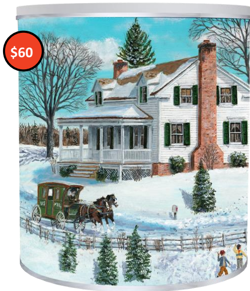
Chocolate Lover's Collection Tin