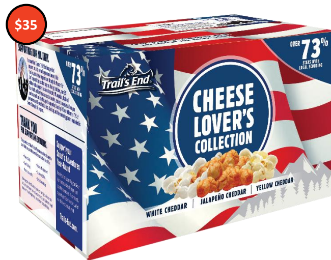
Cheese Lover's Collection Box